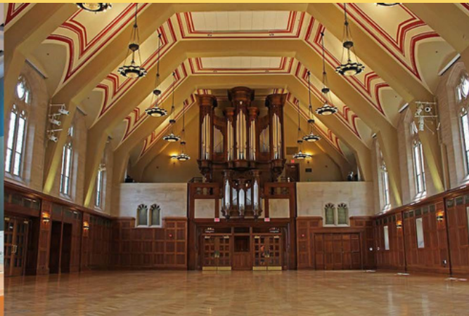
Alumni Hall C. B. Fisk Opus 91