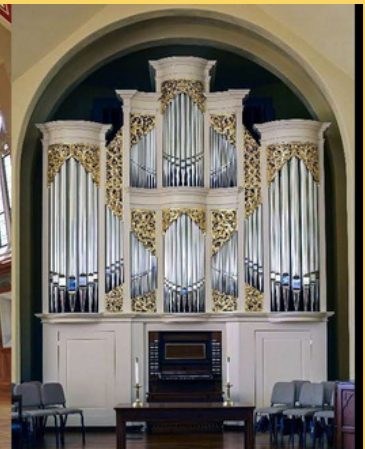
First Presbyterian Paul Fritts Opus 41