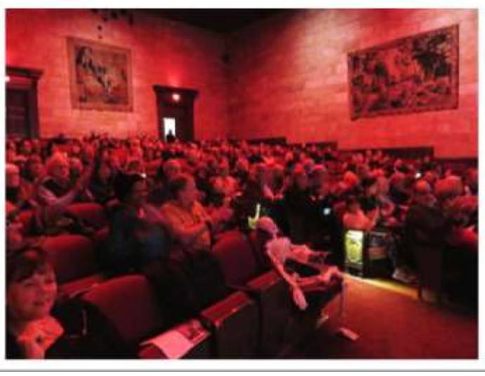
The 2019 Spooktacular Organ Ghouls got even scarier with the addition of Trudy Faber