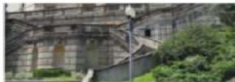
The Dayton Art Institute has presented a series of organ concerts on Thursday Afternoons this summer.