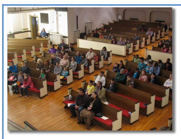
Over forty students attended the PPP!