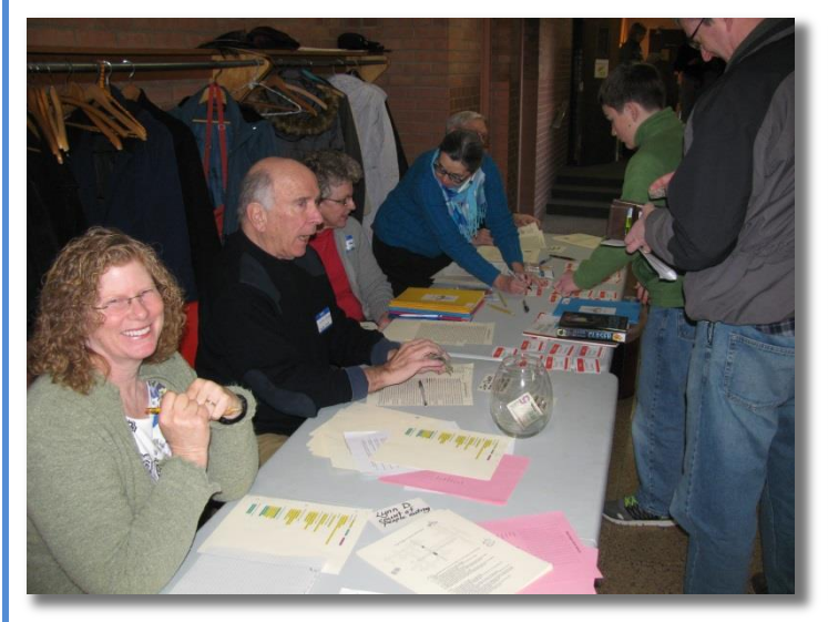
Friendly Faces and the Registration Table

There were over a dozen chapter members and friends there to help with registration, activities and tours. Thanks to everyone who helped out and made the day so much fun.