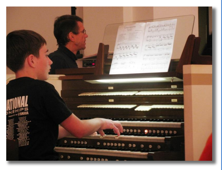
We had some very talented young musicians!