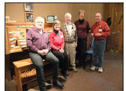
(NOT "family heirlooms")