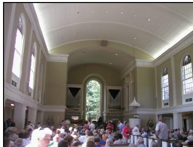
Westminster Presbyterian Church, 1985 Schlicker 3/73 Organized Rhythm; Service of Psalms