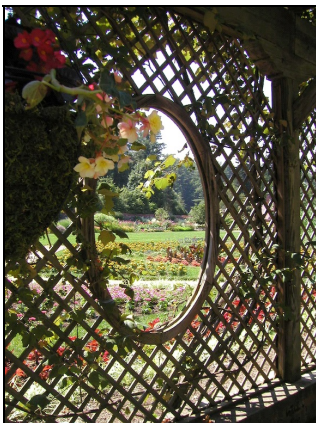
Gardens, Biltmore Estate, Asheville NC