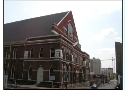
Ryman Auditorium, The Birthplace of Bluegrass Straight No Chaser Concert