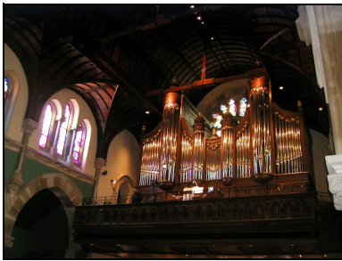
Christ Church Cathedral, 2003 Lively Fulcher 3/58 Rising Stars Recitals; NYACOP/NCOI Winner's Recital