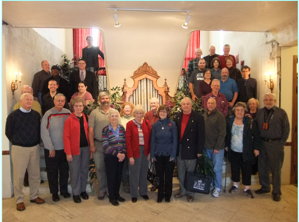
Saturday, November 12 , Dayton Chapter met at Bunn=Minnick Organ Company , Columbus, for a fascinating tour.