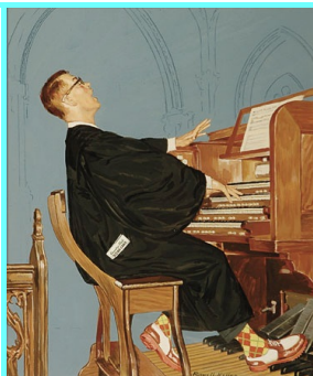
“Before the golf game.” From a 1952 magazine cover.