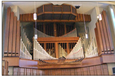
The Kettering Adventist Church Organ