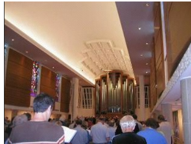
First Presbyterian Church, Birmingham Nichols & Simpson Birmingham-First Chamber Choir