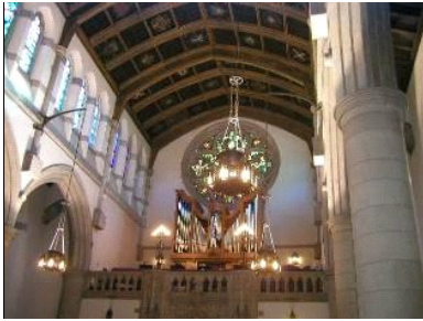
First Congregational Church, Ann Arbor Rising Stars Concert