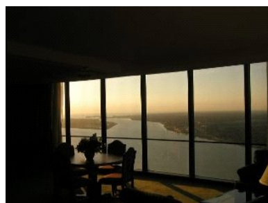
Detroit Renaissance Center Marriott 65 th Floor Suite of rooms overlooking the Detroit River